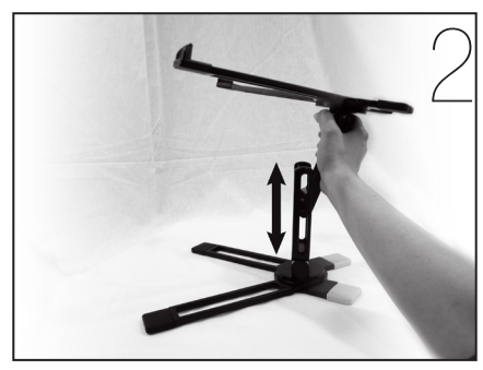
2. Move core to desired height by sliding along arrove.