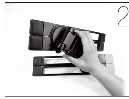
2. Hold central shaft and lift it upward.