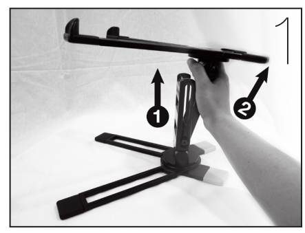
1. Pull back moveable core to disengage it from the central shaft.