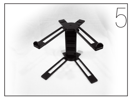
5. Before folding up, please make sure laptop stand is set at the lowest(default) height (see instructions below for height adjustment). Reverse steps 4-1 to fold up.