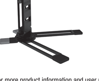
For more product information and user manual in different languages, please go to HERCULES official website www.herculesstands.com

Please always make sure both knobs are well tightened before use.