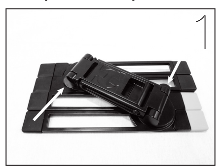
1. Make sure that the yellow rubber feet are on the RIGHT side, and loosen both knobs.