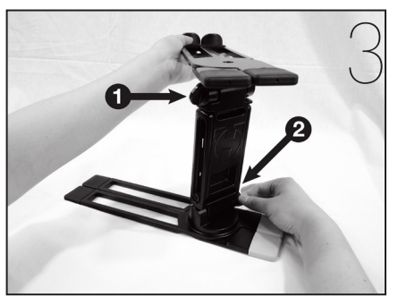
3. Turn upper tray up, tighten both knobs to fix upper tray and base position.