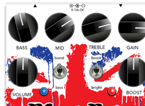
For those about to rock...