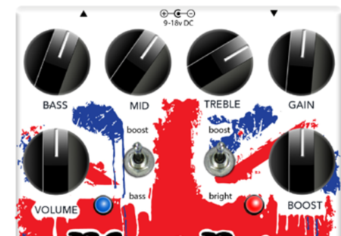
A cooking Plexi