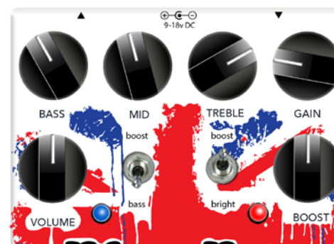
Where you going with that gun in your hand?