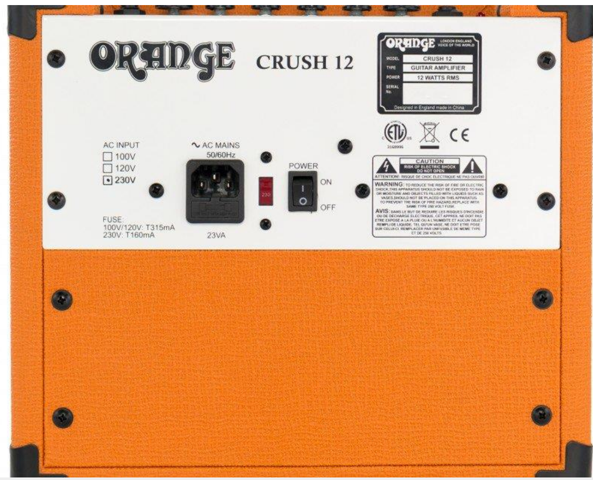
AC Mains Input

Refer to 'Before Using Your Amplifier'. Connect the supplied IEC cable to the AC Mains Input. Ensure the Power switch is set to OFF before connecting the IEC cable.